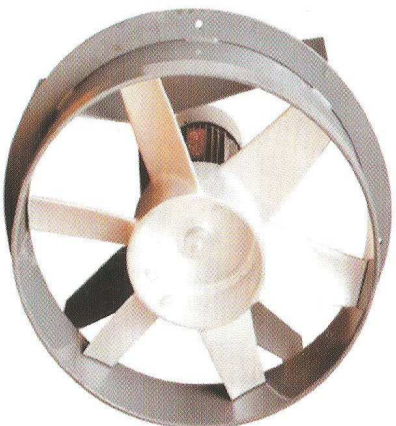
WALL MOUNTED AXIAL FLOW FAN