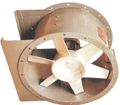
DUCT MOUNTED AXIAL FLOW FAN