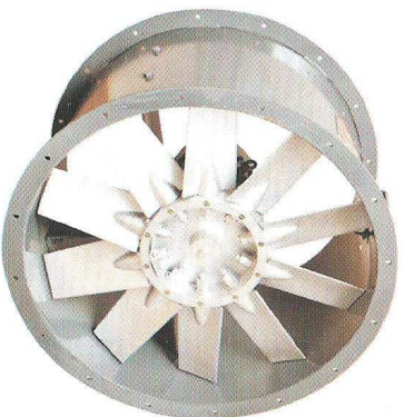
VARIABLE PITCH AXIAL FLOW FAN