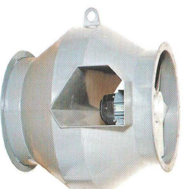
BI-FURCATED AXIAL FAN

Almonard has been founded by technocrats, the pioneers in this field for more than 4 decades. Almonard Axial flow fans is suited for a large number of air handling applications in land & marine installations, commercial, industrial process & environment ventilation. Almonard manufactures regular series of fans and custom built fans to cater the specific needs of automobile, chemical, nuclear, cement, steel, paper, sugar, textile plants, general engineering, foundries, jute mills, brewery, hotels & marine duty application etc.